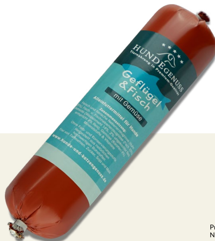
Product Illustration 800g, Not to scale

16 mg Zinc oxide (Zinc 13 mg) 4 mg Copper (II) sulfate pentahydrate (Copper 1 mg)