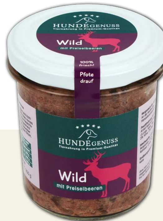
Product Illustration 300g, Not to scale