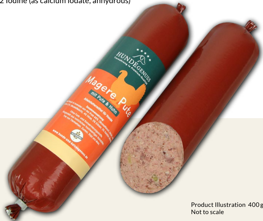
Product Illustration 400g, Not to scale