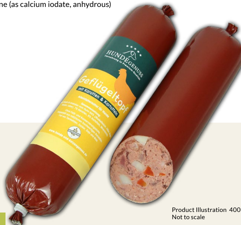
Product Illustration 400g, Not to scale