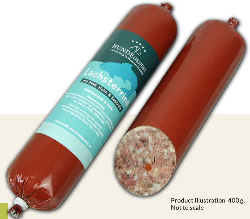
Product Illustration 400g, Not to scale