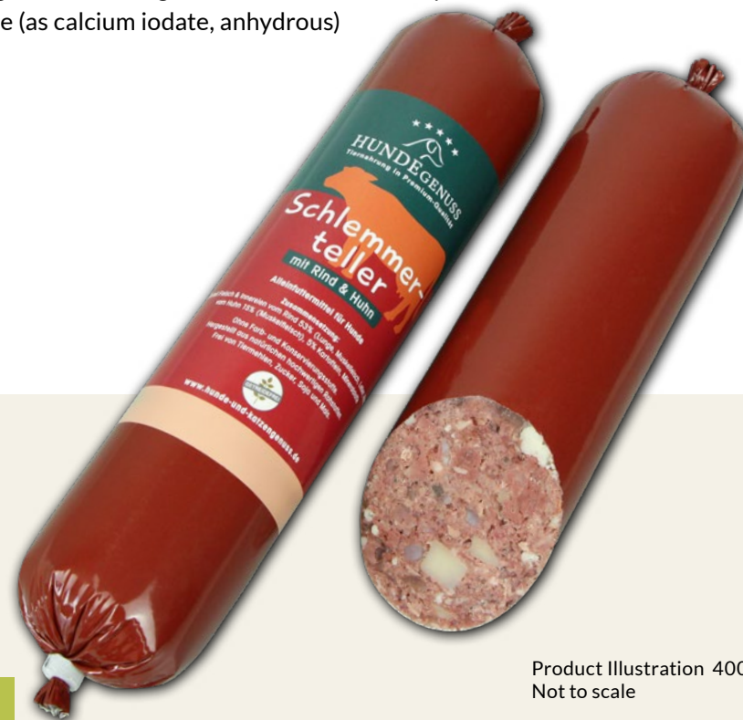
Product Illustration 400g, Not to scale