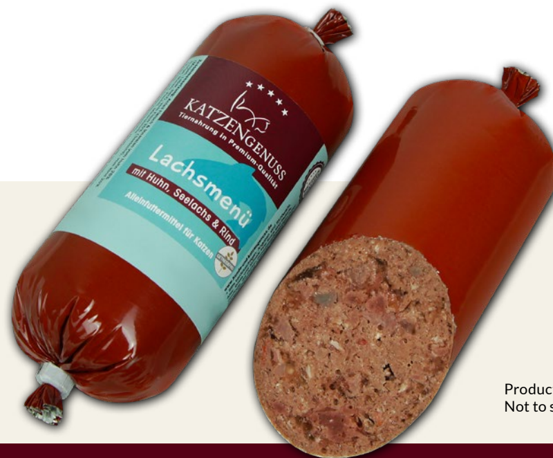
Product Illustration 200g, Not to scale