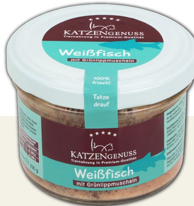
Product Illustration 200g, Not to scale