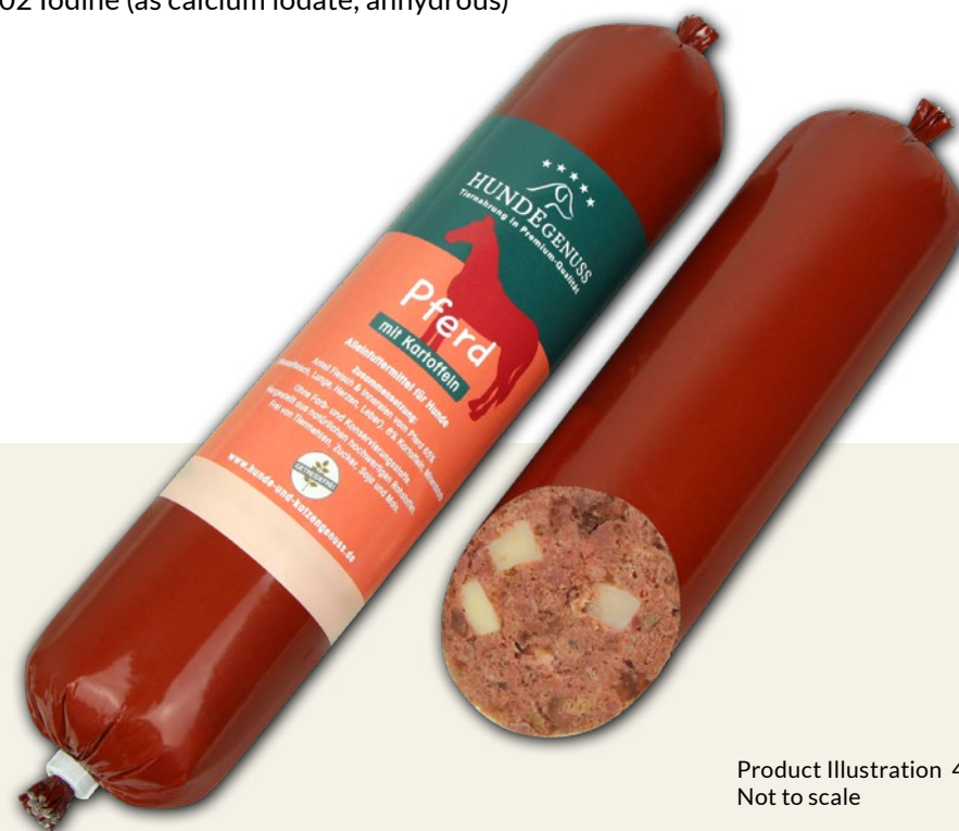
Product Illustration 400 g, Not to scale