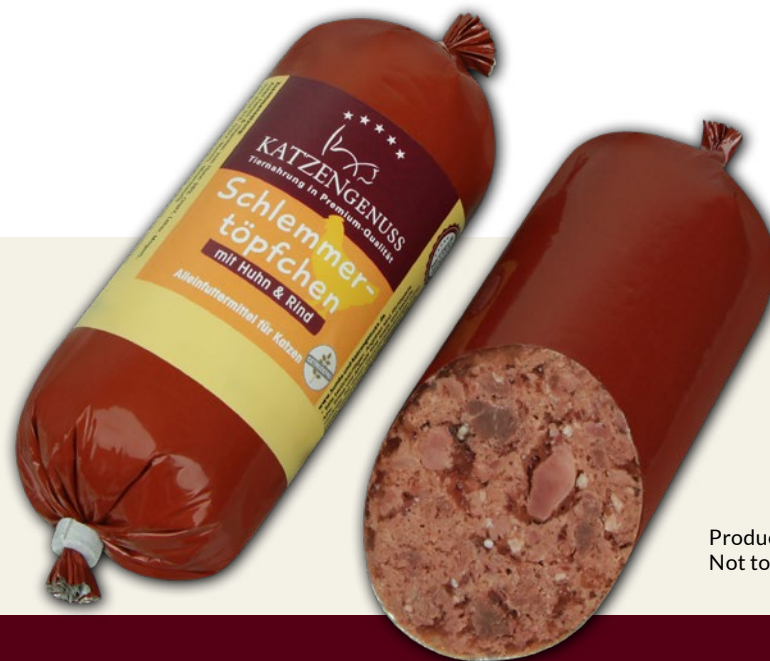
Product Illustration 200g, Not to scale