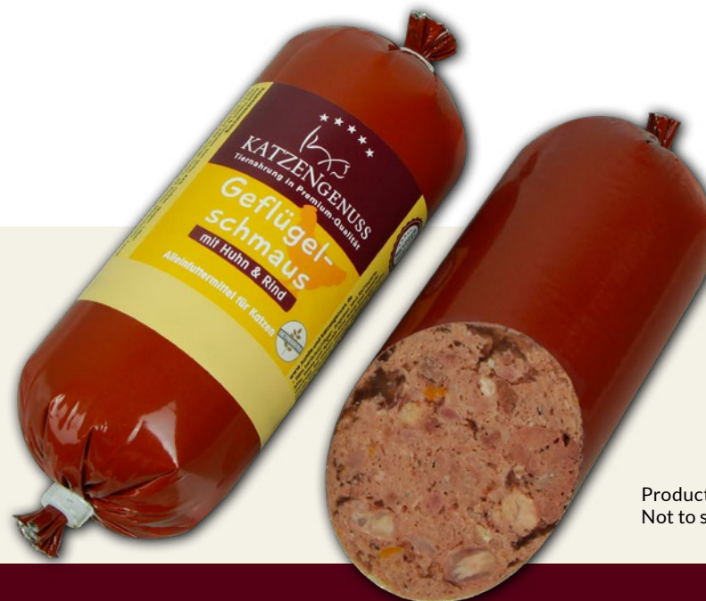
Product Illustration 200g, Not to scale