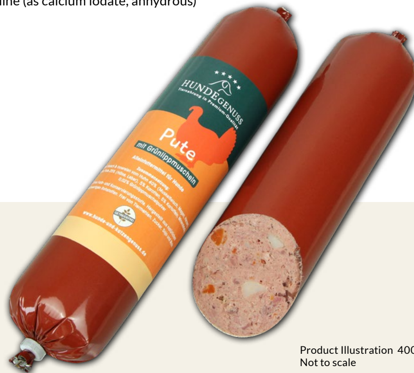
Product Illustration 400 g, Not to scale

30 mg 3a700 Vitamin E (as all-rac-alpha-tocopheryl acetate) 15 mg 3a671 Vitamin D3 200, 3b605 Zinc (as zinc sulfate, monohydrate) 3 mg 3b503 Manganese (as manganese (II) sulfate, monohydrate) 0.75 mg 3b202 Iodine (as calcium iodate, anhydrous)