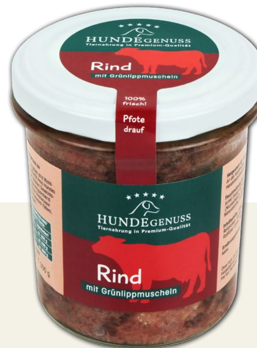
Product Illustration 300g, Not to scale