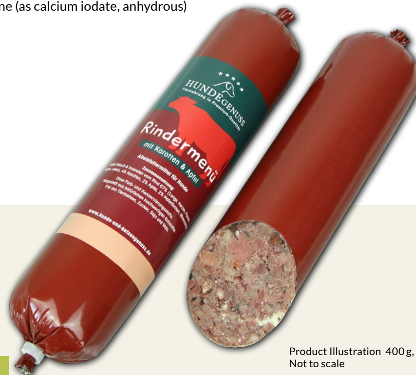
Product Illustration 400g, Not to scale