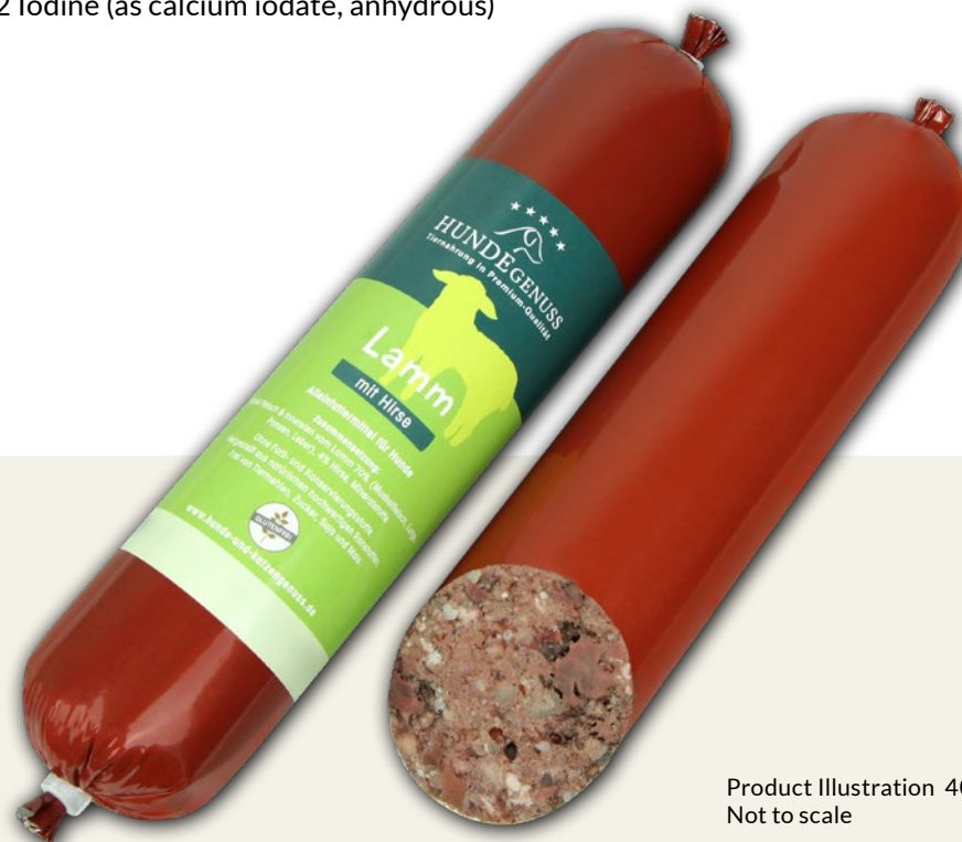
Product Illustration 400 g, Not to scale