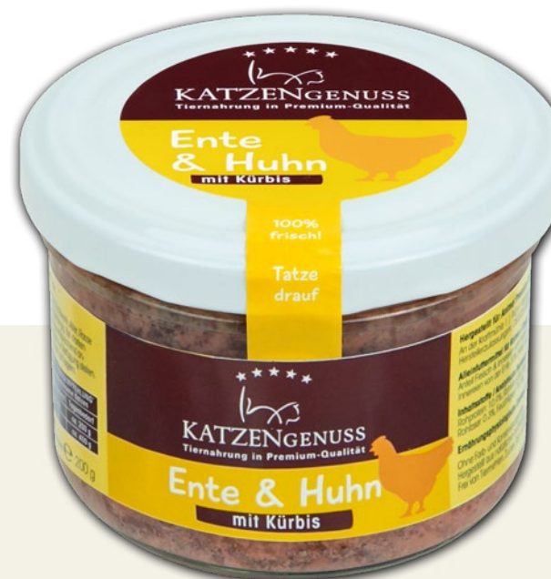
Product Illustration 200g, Not to scale