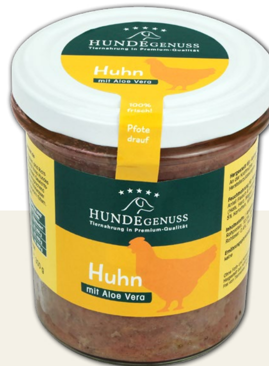
Product Illustration 300g, Not to scale