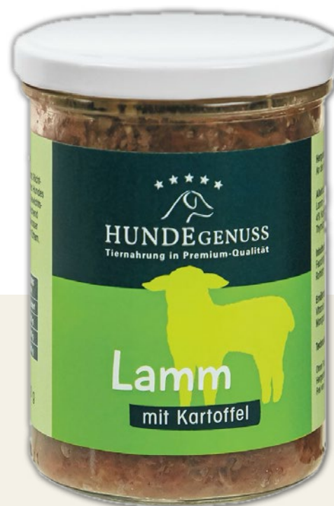
Product Illustration 300g, Not to scale