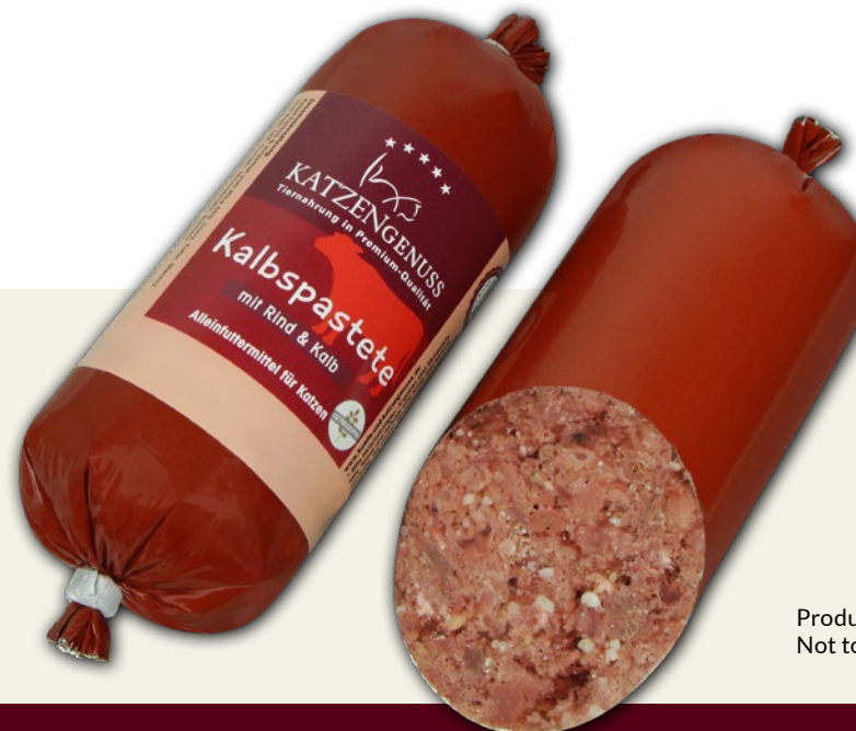
Product Illustration 200g, Not to scale