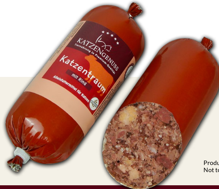
Product Illustration 200g, Not to scale