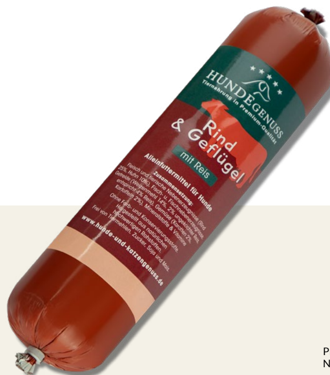
Product Illustration 800g, Not to scale