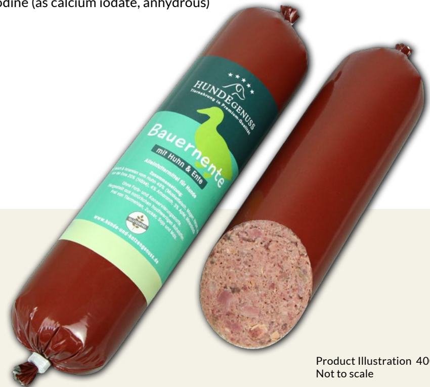
Product Illustration 400g, Not to scale