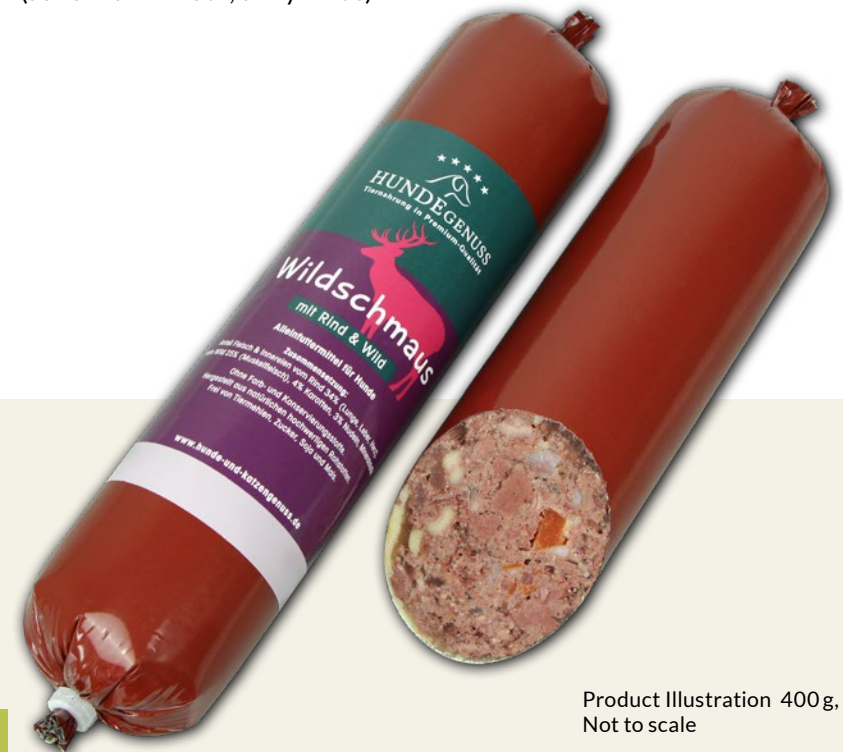
Product Illustration 400g, Not to scale