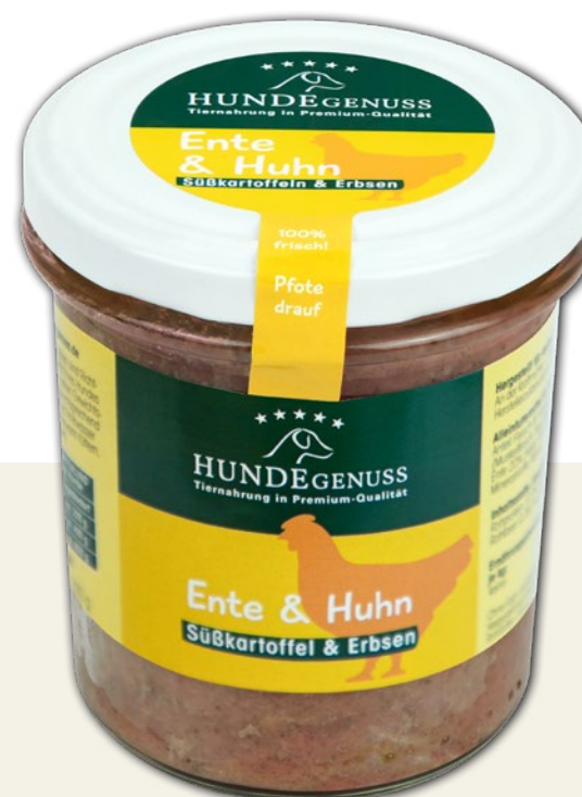
Product Illustration 300g, Not to scale