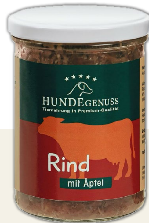
Product Illustration 300g, Not to scale